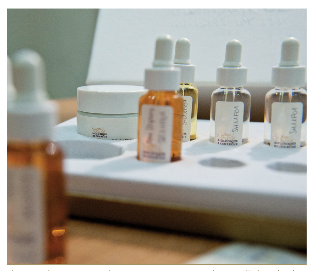
The 6-month Haute Couture box set contains 2 creams and 8 specially formulated serums: a collection of over 60 specifically targeted active ingredients provides a solution to the particular problems of all Skin Instants<sup>©</sup>.