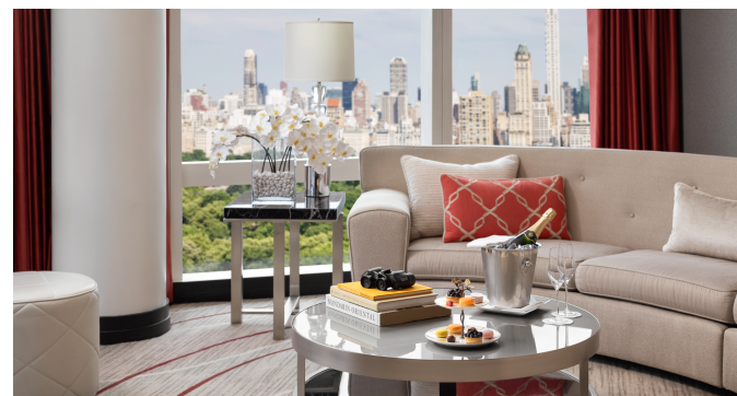
CENTRAL PARK VIEW SUITE