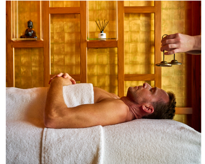
THE SPA AT MANDARIN ORIENTAL, NEW YORK

An oasis of relaxation and rejuvenation high above New York, The Spa at Mandarin Oriental, New York offers a blend of treatments as inspiring as the city itself. Beautifully designed with the city skyline as its backdrop, the Forbes Five-Star spa's chic décor blends Eastern influences with contemporary New York touches. The 14,500 square-foot award-winning spa and fitness center features eight treatment rooms, including a VIP Spa Suite, providing a range of treatments in luxurious and soothing surroundings. The Spa's unique elements also include an oxygenated vitality pool, amethyst crystal steam room, experience showers, an Oriental-style tea lounge, relaxation lounges, a high performance fitness center with multi-sensory exercise equipment and a naturally-lit 75-foot lap pool.