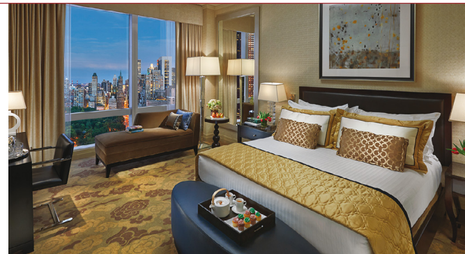
CENTRAL PARK VIEW ROOM

SUITES Guests can select from a variety of suite layouts strategically located in the corners of the hotel to maximize the dramatic floor-to-ceiling views of Central Park and the Hudson River, all while enjoying attentive service and every additional luxury.