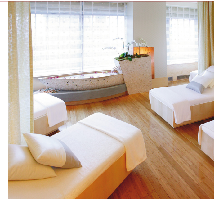
THE SPA AT MANDARIN ORIENTAL, NEW YORK

An oasis of relaxation and rejuvenation high above New York, The Spa at Mandarin Oriental, New York offers a blend of treatments as inspiring as the city itself. Beautifully designed with the city skyline as its backdrop, the Forbes Five-Star spa's chic décor blends Eastern influences with contemporary New York touches. The 14,500 square-foot, award-winning spa and fitness center features eight treatment rooms, including a VIP Spa Suite, providing a range of treatments in luxurious and soothing surroundings. The Spa's unique elements also include an oxygenated vitality pool, amethyst crystal steam room, experience showers, an Oriental-style tea lounge, relaxation lounges, a high performance fitness center with multi-sensory exercise equipment and a naturally-lit 75-foot lap pool.