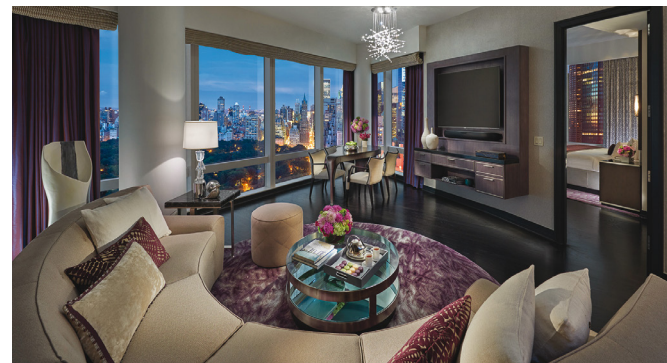
PREMIER CENTRAL PARK VIEW SUITE