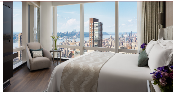
HUDSON RIVER VIEW SUITE

SUITES Guests can select from a variety of suite layouts strategically located in the corners of the hotel to maximize the dramatic floor-to-ceiling views of Central Park and the Hudson River, all while enjoying attentive service and every additional luxury. All suite guests receive welcome amenities to complement their stay.