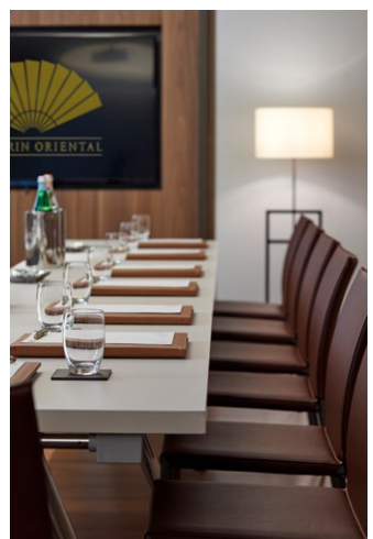
With an excellent location in the city's centre, Mandarin Oriental, Milan offers first class business services, catering, and technology ready facilities.