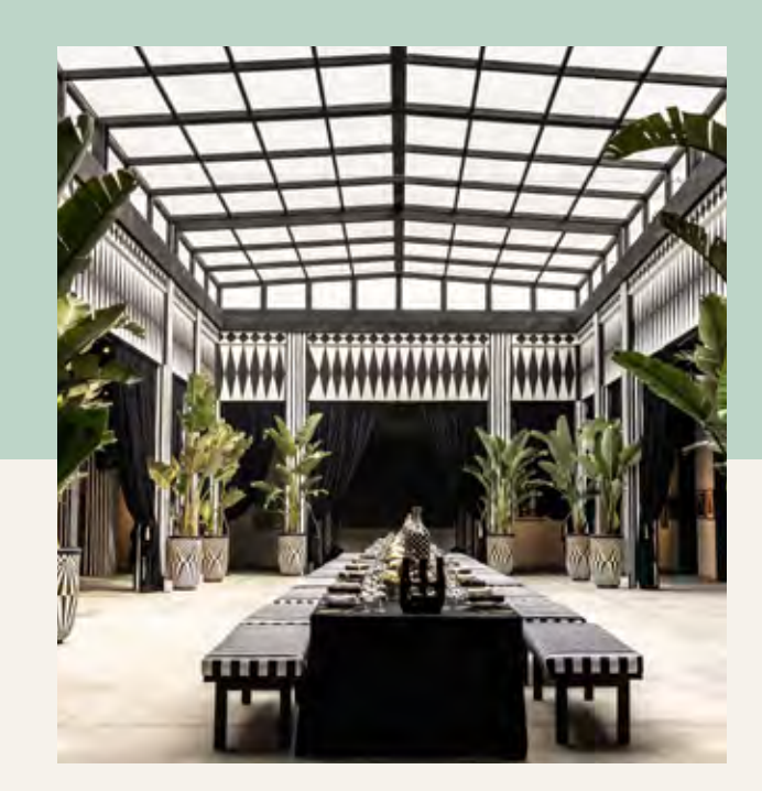
M.O STUDIO 600 SQM | UP TO 800 GUESTS

For smaller meetings or elegant breakouts, these refined spaces combine discretion and daylight and can easily be used as offices, secretariat or cloakroom during gala dinners.