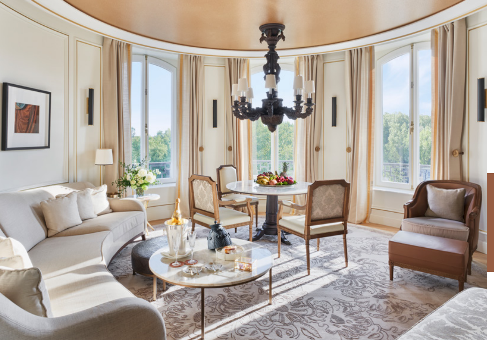
King bed | Luxurious living room | Extra courtesy bathroom | Extra bed on request Connecting rooms available | 78sqm / 840sqf | Garden, Square or Museum view