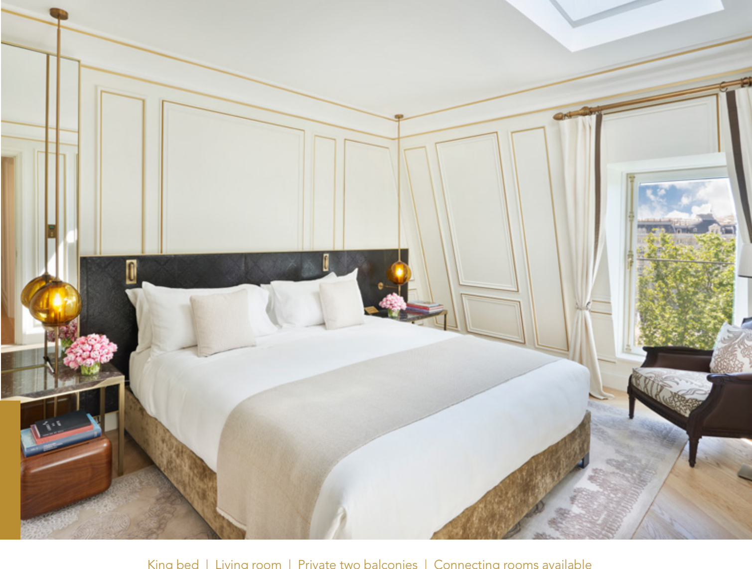
King bed | Living room | Private two balconies | Connecting rooms available Extra bed on request | 73sqm / 786sqf | Ritz garden view