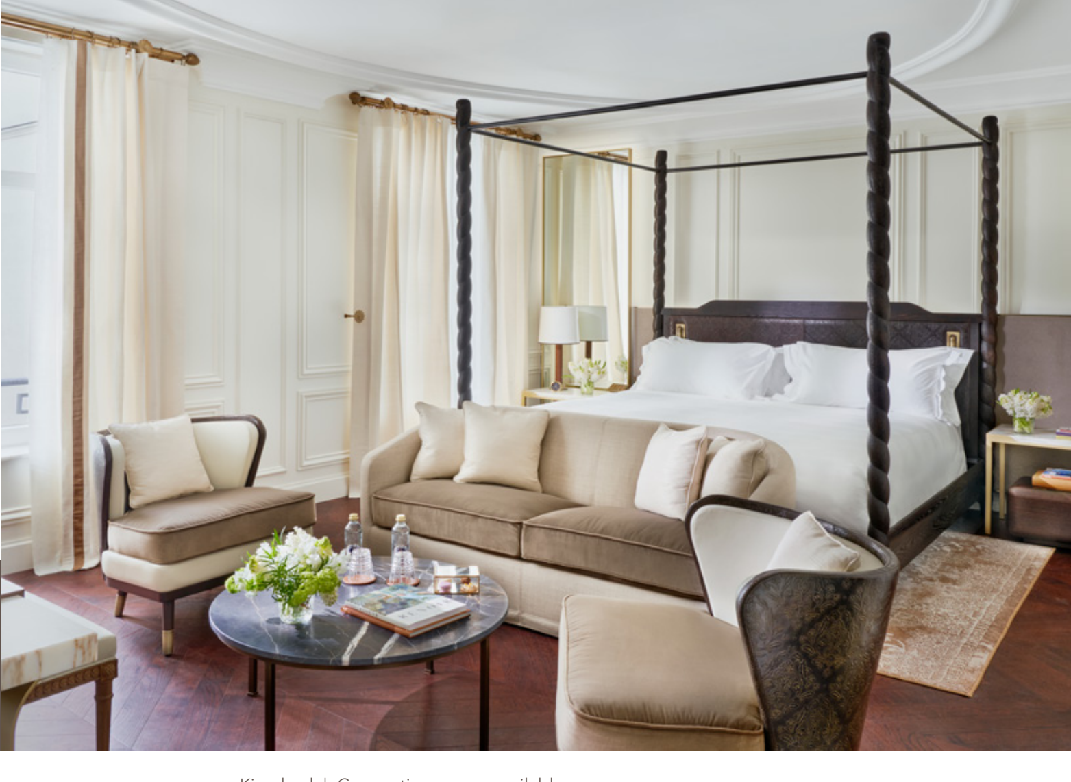
King bed | Connecting rooms available 50sqm / 538sqf | Courtyard view