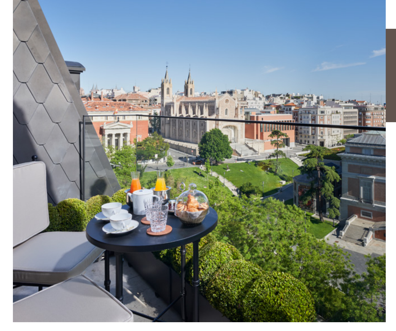
King bed | Living room | Private two balconies | Connecting rooms available Extra bed on request | 66sqm / 710sqf | Prado Museum view