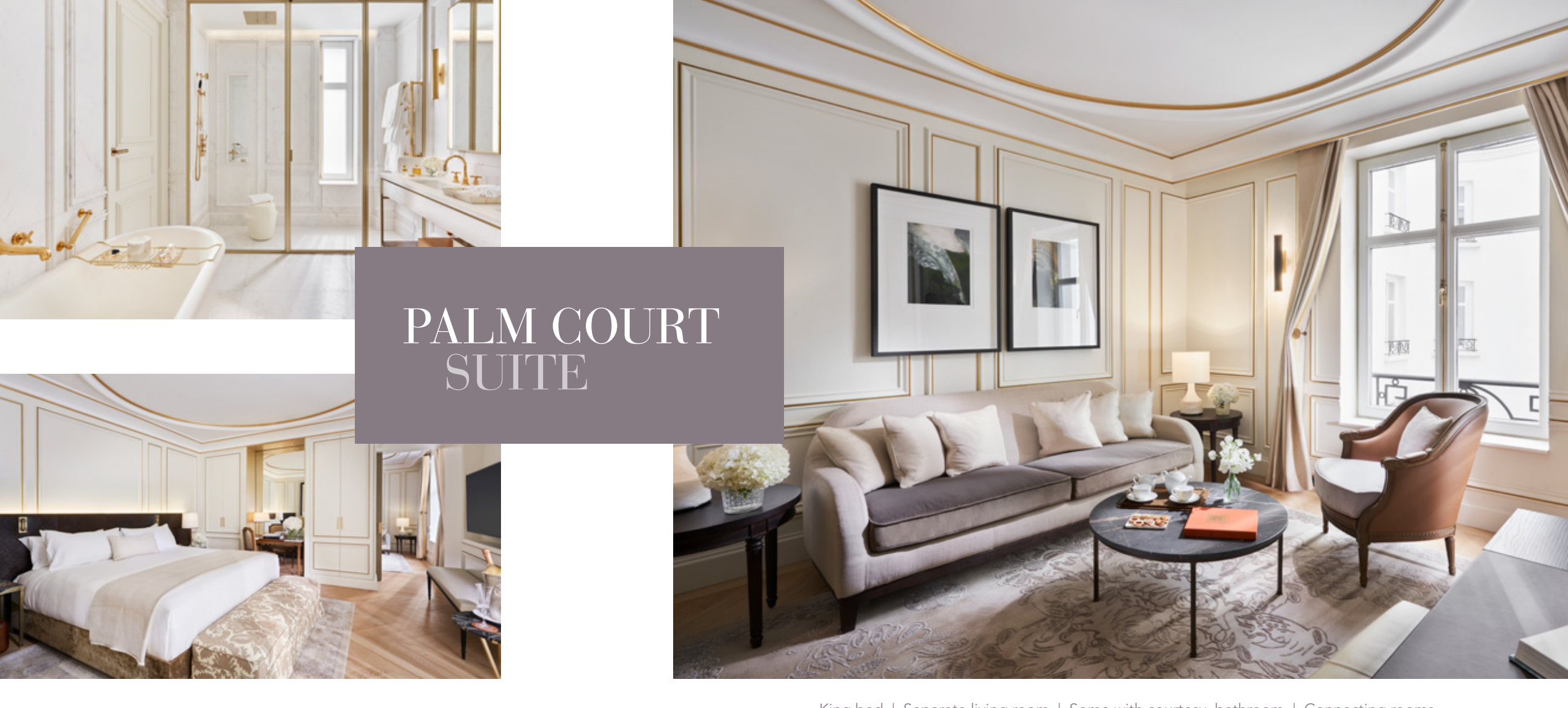
King bed | Separate living room | Some with courtesy bathroom | Connecting rooms 52sqm / 560sqf | Courtyard view