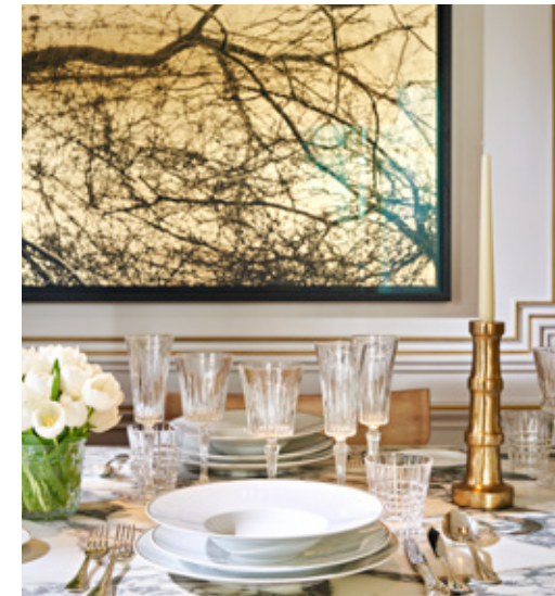
King beds | 187sqm / 2013sqf | Hall | Two bedrooms one circular Walk in wardrobe | Two Living rooms | Dining area | Guest powder room Steam room | Garden and Prado Museum views