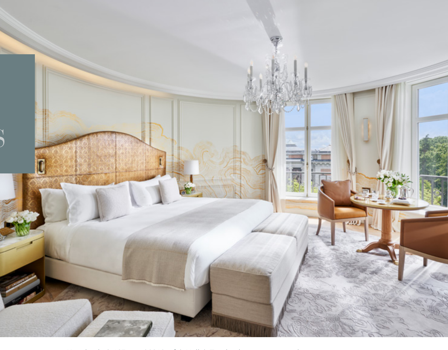
King beds | 187sqm / 2013sqf | Hall | Two bedrooms one circular Walk in wardrobe | Two Living rooms | Dining area | Guest powder room Steam room | Garden and Prado Museum views