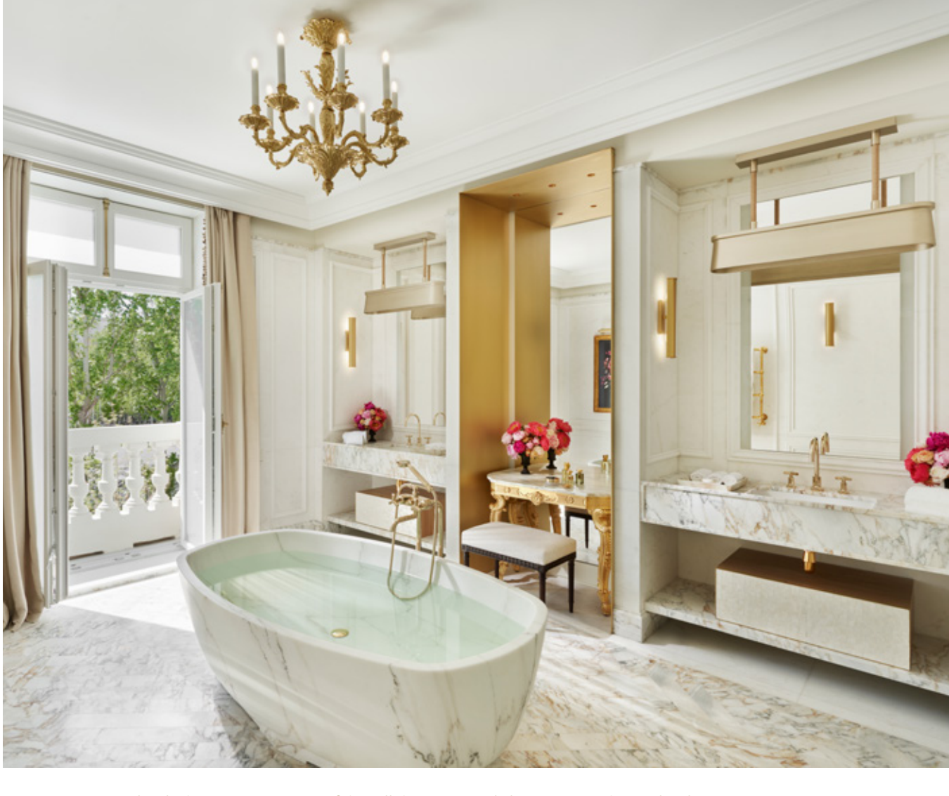
King beds | 228sqm / 2454sqf | Hall | Living and dining room | Two bedroom Circular master bedroom | Pantry | Study room / Walk in wardrobe | Guest powder room Steam room and shower | French balcony | Views of garden and Prado Museum