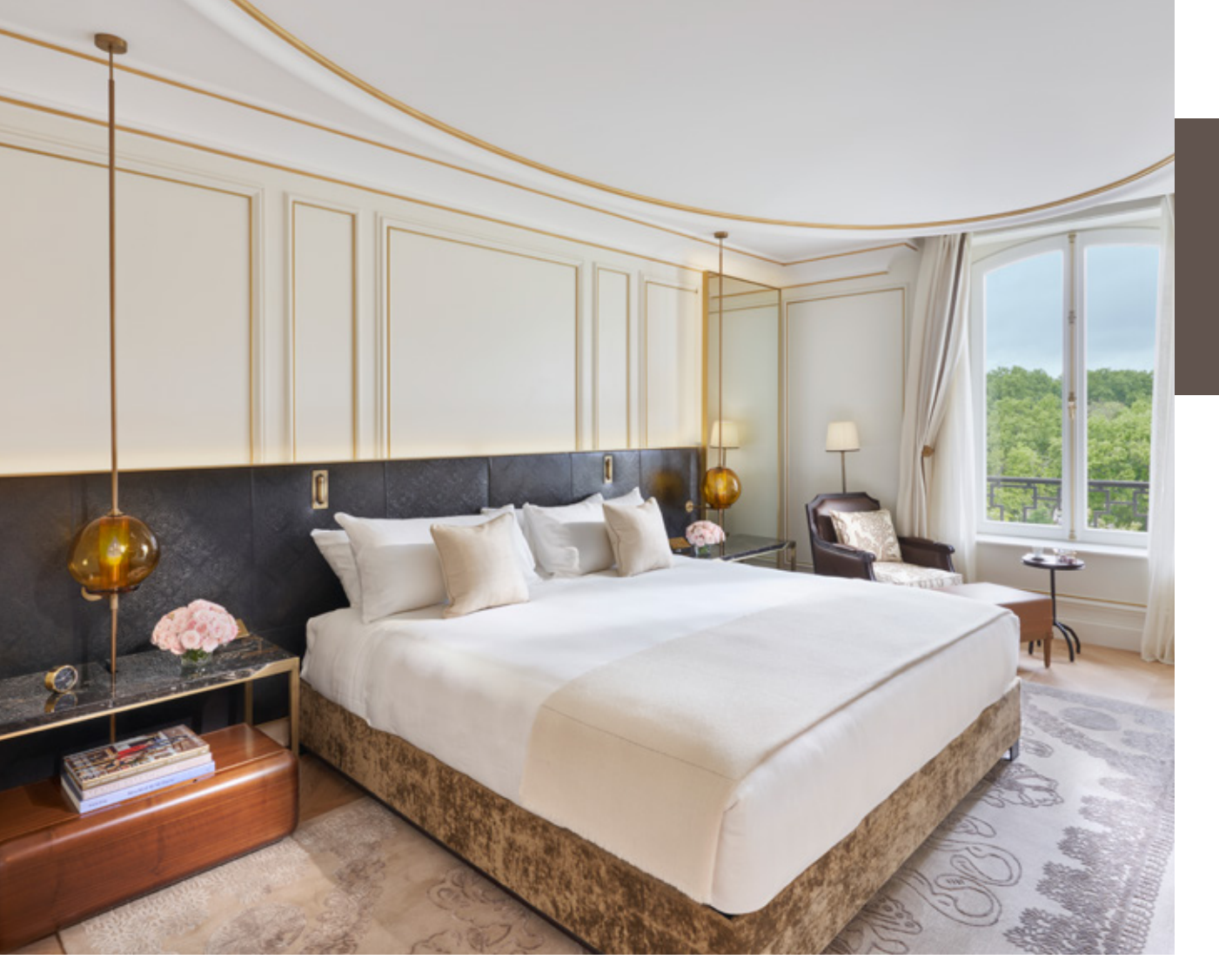
King bed | Separate living room | Connecting rooms available | Extra bed on request 68sqm / 732sqf | Lealtad square view