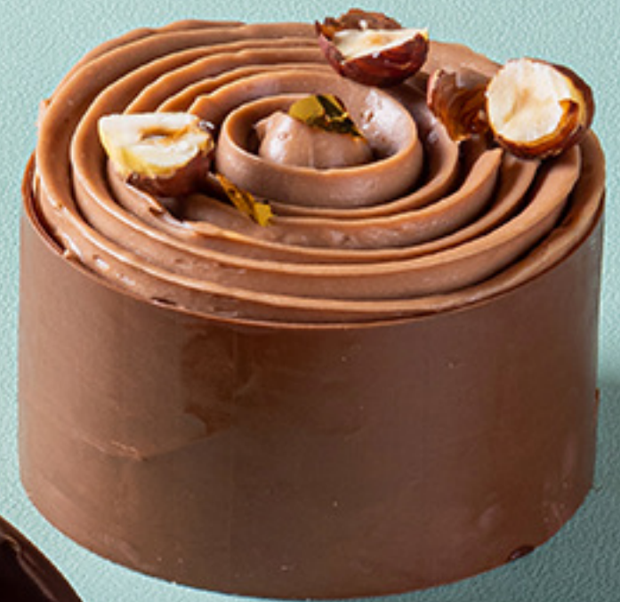
Black Sesame Hazelnut IDR 108.000 Net