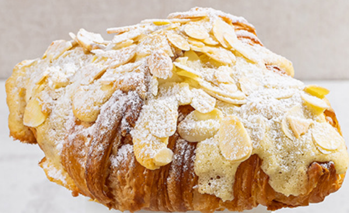
Almond Croissant IDR 85.000 Net