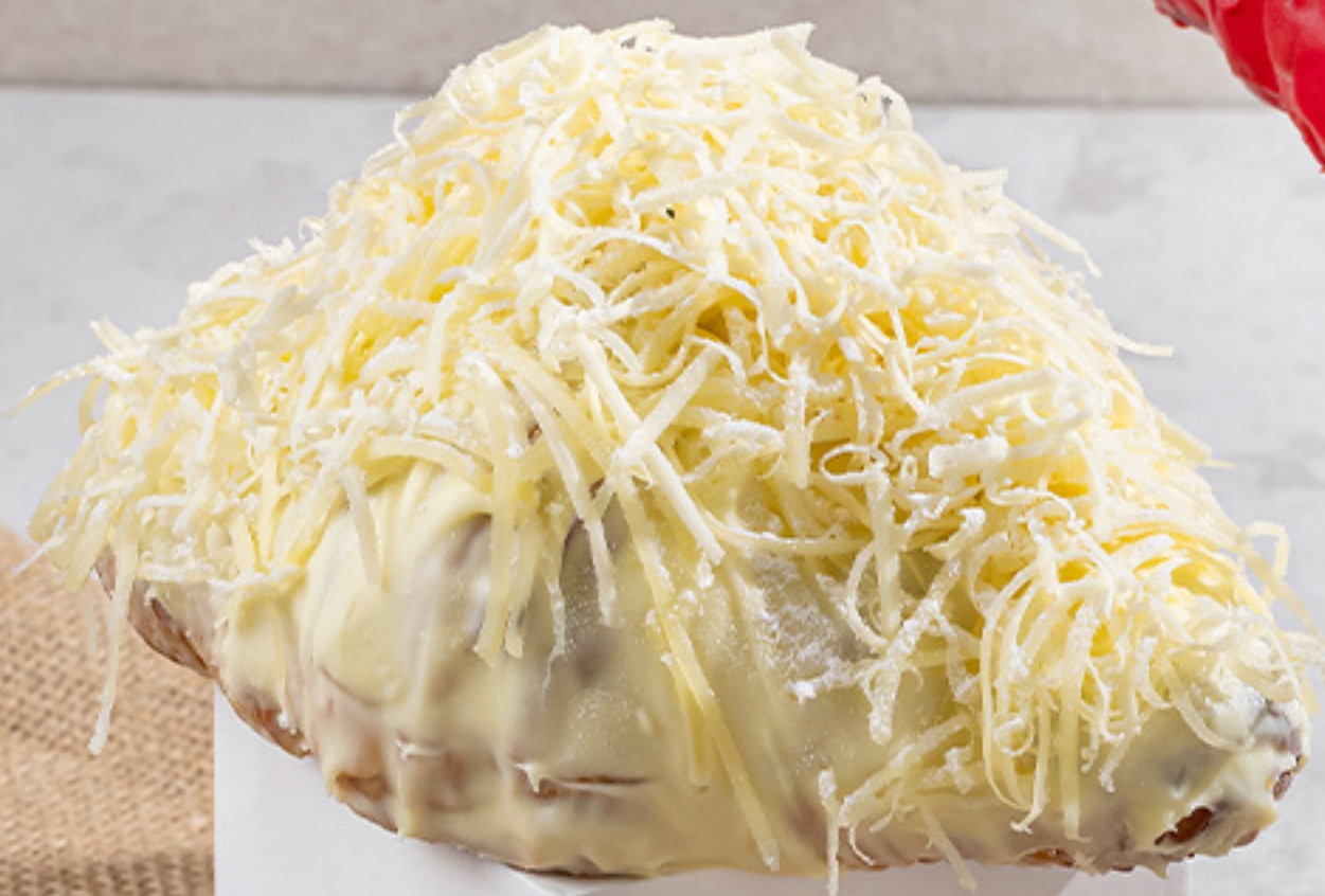
Triple Cheese Croissant IDR 85.000 Net