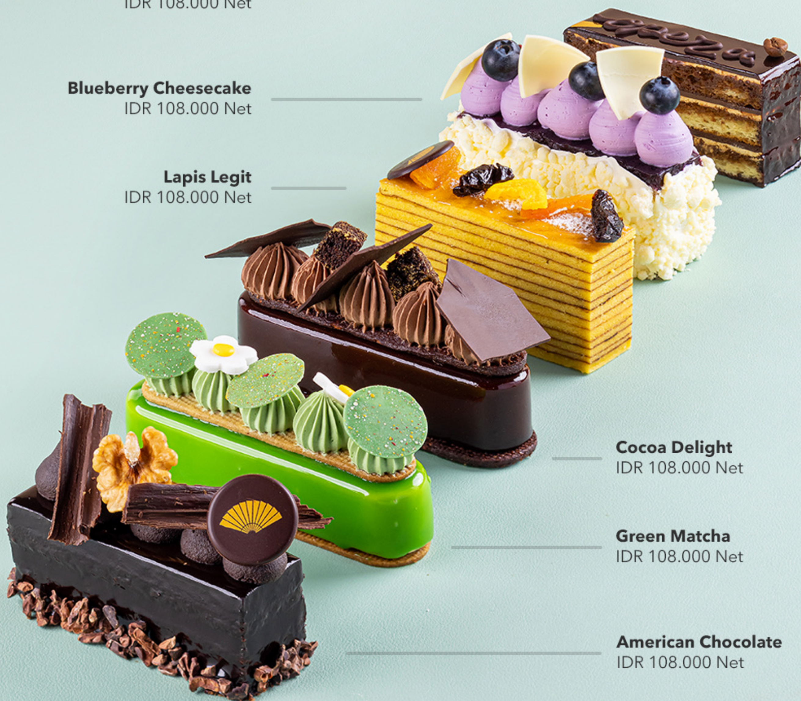
American Chocolate IDR 108.000 Net