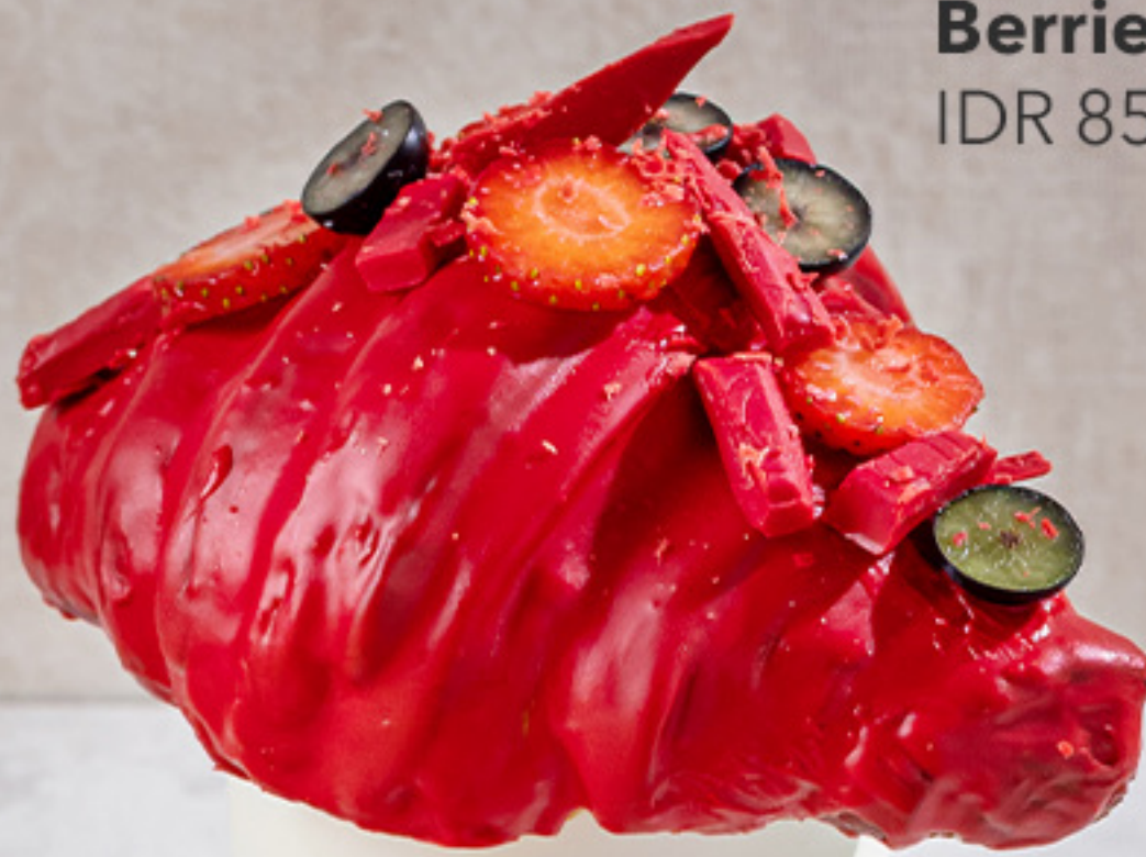
Berries Croissant IDR 85.000 Net