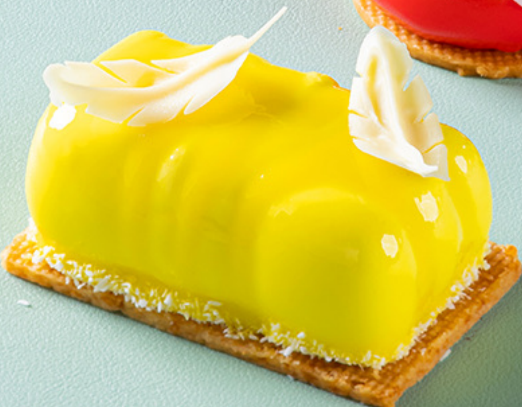
Exotic Pineapple IDR 108.000 Net