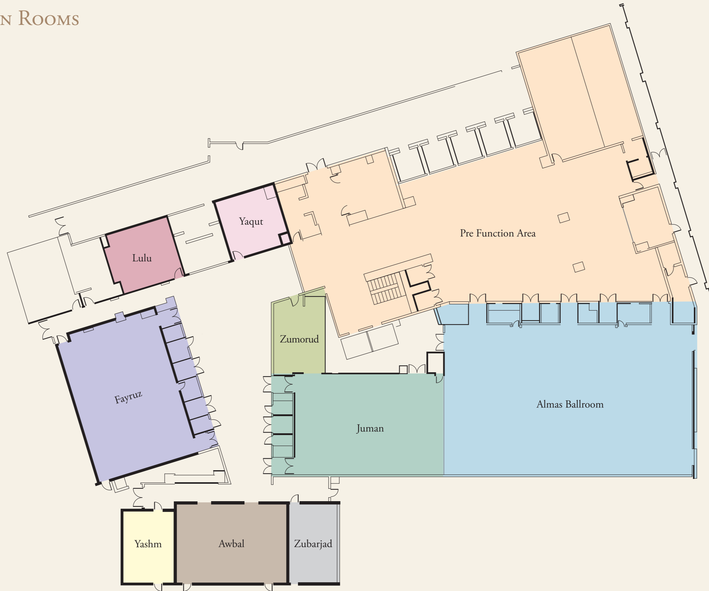
ALMAS 1, 2, 3 & JUMAN