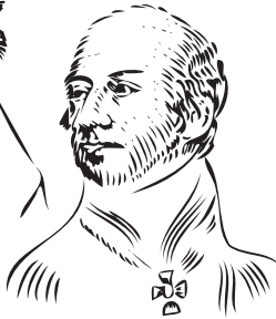
Rear Admiral LODEWIJK VAN HEIDEN