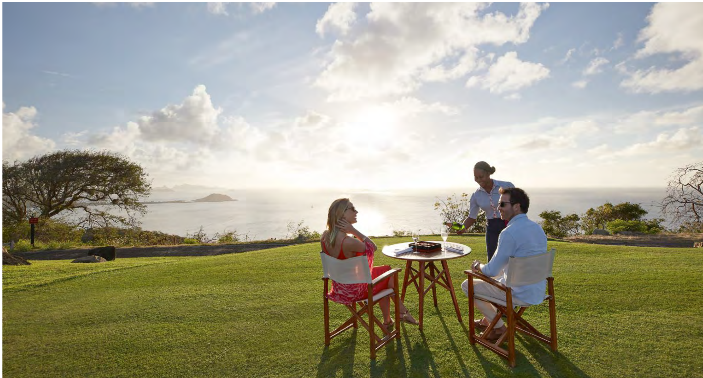
Set on a hilltop bluff, the Signature Hole at the 18-hole championship golf course — designed by links legend Jim Fazio — provides panoramic Atlantic and Caribbean views for a cocktail party or secluded ceremony.