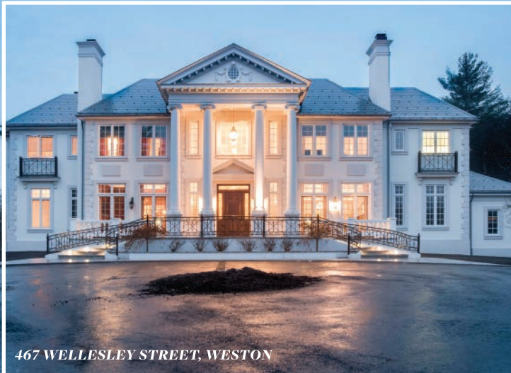
467 WELLESLEY STREET, WESTON