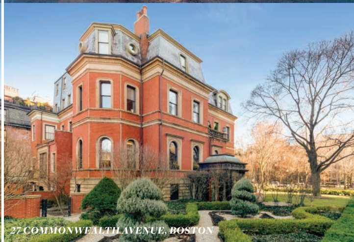
27 COMMONWEALTH AVENUE, BOSTON