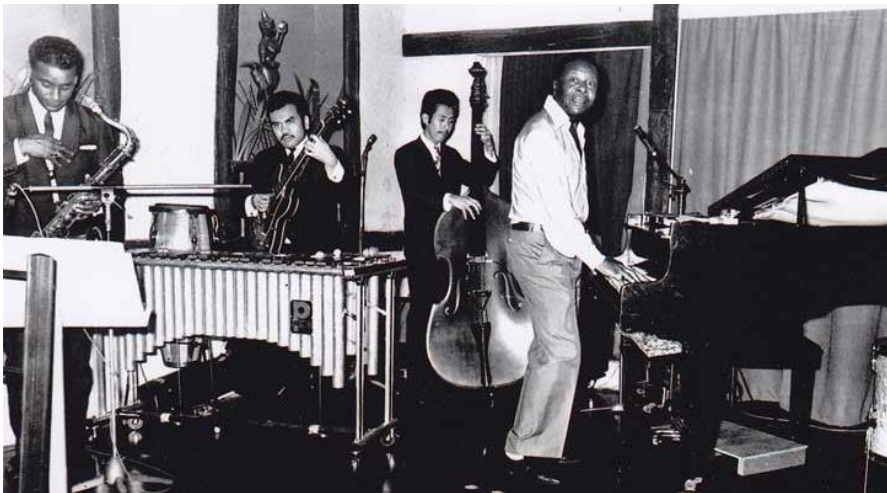
Bamboo Bar in the 1960's

All bottles come with unlimited premium mixers & ice. Additional bottles can be arranged subject to availability