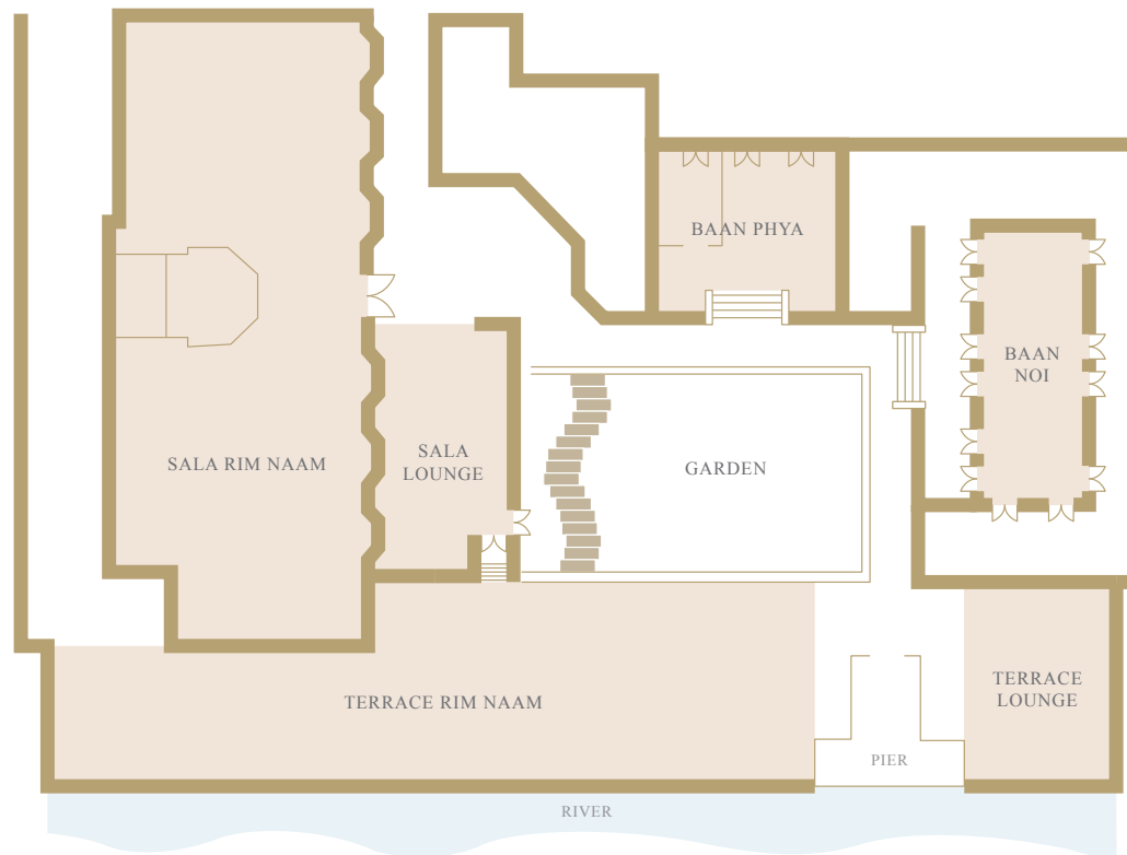
Function Room Capacity Table