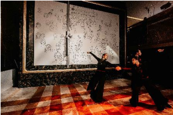
Entertainment was provided by Hong Kong Performing art groups including Hong Kong Dance Company, The Hong Kong Academy for performing Arts