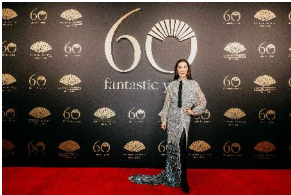
Ms Michelle Yeoh arrives at the red carpet at Mandarin Oriental, Hong Kong 60th Anniversary gala party