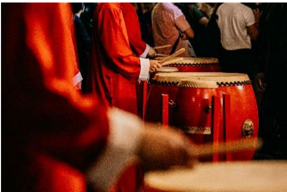
On arrival, guests were greeted by Hong Kong Drum Ensemble on a star-studded red carpet on Connaught Road.

Please click here to download in high-res: