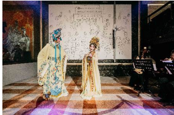
Chinese Opera performed at the Mandarin Oriental, Hong Kong 60th Anniversary gala party