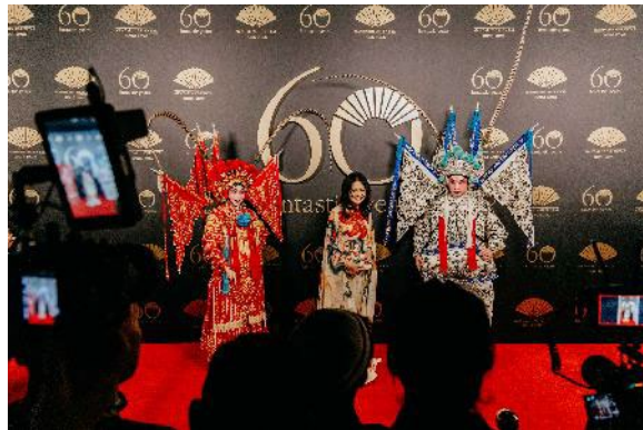
Ms Vivienne Tam arrives at the red carpet for Mandarin Oriental, Hong Kong 60th Anniversary gala party greeted by Chinese Opera Ensemble