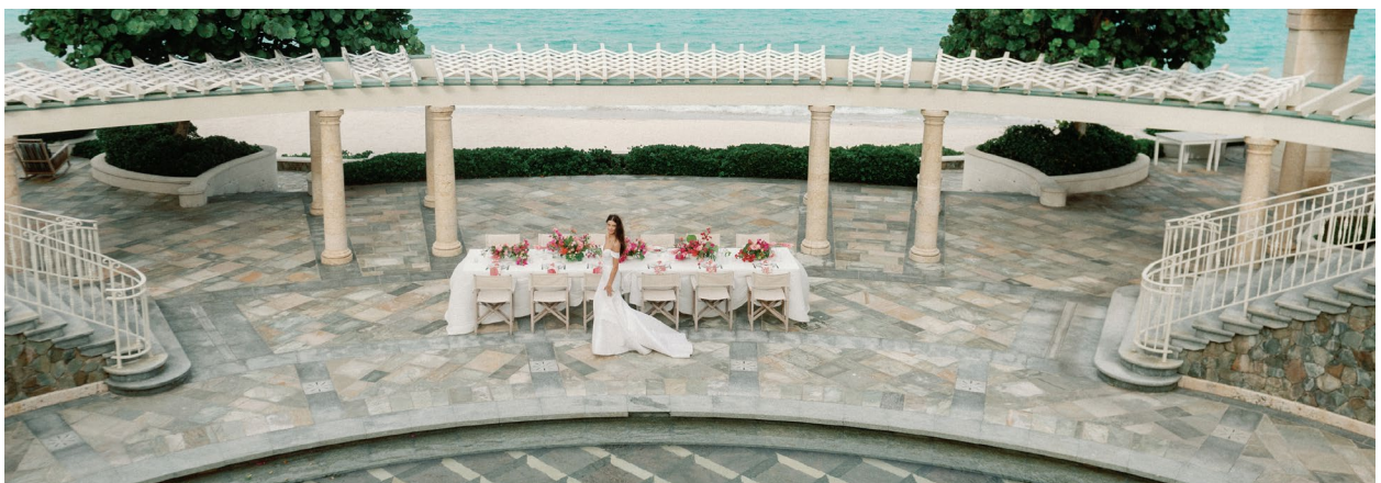
Crescent Court Available for events for up to 60 guests