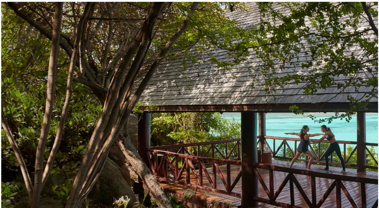
The Spa's meditation pavilion is an inspiring, tranquil open-air space for yoga and meditation.