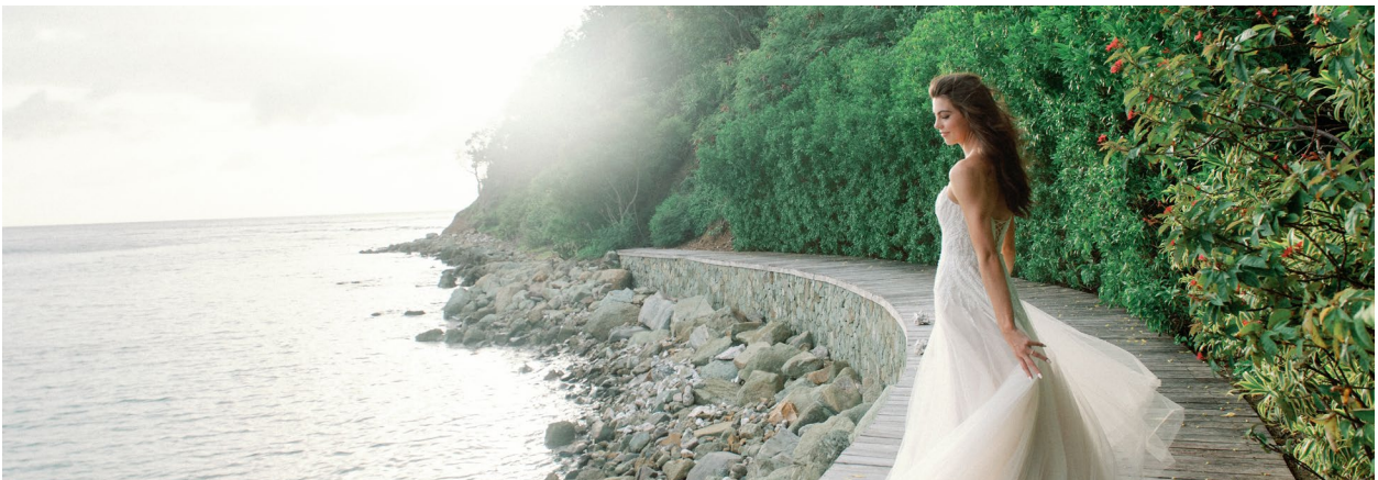
L'Ance Guyac Available for events for up to 60 guests