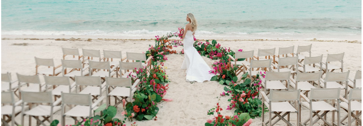
Godahl Beach Available for events for up to 80 guests after 4pm