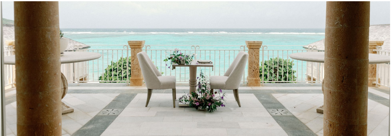
Tides Terrace Available for events for up to 50 guests