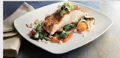
SEARED COD WITH ROMESCO SAUCE S$78