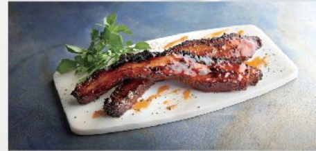
NUESKE'S BACON STEAK WITH PEACH BOURBON GLAZE S$20