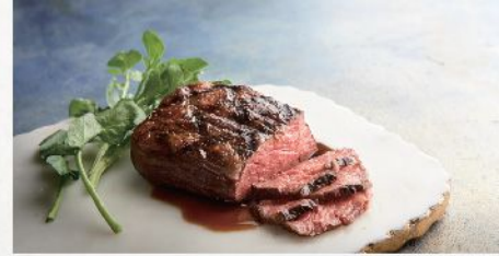
8 OZ. AMERICAN WAGYU ROYALE RIBEYE CAP STEAK S$112