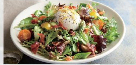
BURRATA, GRILLED ASPARAGUS & BABY HEIRLOOM TOMATO SALAD S$32