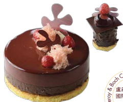
Raspberry Chocolate Truffle 紅桑子朱古力餅 1lb磅 $288 · 1pc件 $88