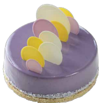
Cassis Coconut Sago, Red Fruit Compote with Pistachio Sponge 黑加侖子椰子紅果醬開心果蛋糕 1lb磅 $258 · 1pc件 $68