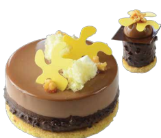
Caramel Pop-corn Chocolate Truffle 焦糖爆谷朱古力餅 1lb磅 $288 · 1pc件 $88