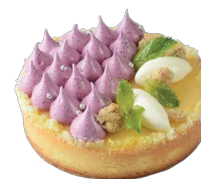
Passion Fruit Cream with Candied Ginger Tart 熱情果忌廉糖漬薑撻 1lb磅 $258 · 1pc件 $68