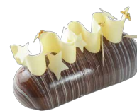
Calamansi & Chocolate Cream Cake with Stone Fruit Compote 香果柑桔朱古力忌廉蛋糕 1lb磅 $258 · 1pc件 $68