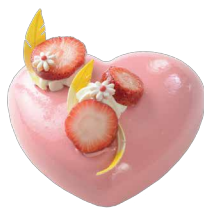
White Peach & Strawberry Mousse 白桃草莓慕絲 1lb磅 $258 · 1pc件 $68