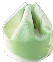
Green Tea & Red Bean Opera 綠茶紅豆蛋糕 1lb磅 $258 · 1pc件 $68