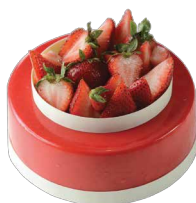
Strawberry Mousse with Roselle & Fig Compote 草莓慕絲洛神花無花果醬蛋糕 1lb磅 $258 · 1pc件 $68