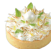
Passion Fruit & Coconut Cream with Pineapple Tart 熱情果椰子菠蘿撻 1lb磅 $258 · 1pc件 $68