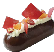
Earl Grey Tea Mousse with Orange Compote 伯爵茶慕絲香橙蛋糕 1lb磅 $258 · 1pc件 $68