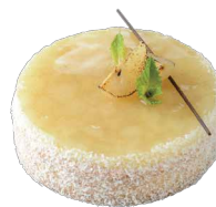
Yuzu & Pear Cream Tart 柚子雪梨撻 1lb磅 $258 · 1pc件 $68