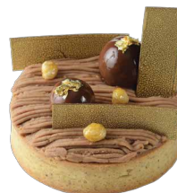
Chestnut & Vanilla Crème Brûlée with Hazelnut Tart 栗子焦糖布丁榛子撻 1lb磅 $258 · 1pc件 $68