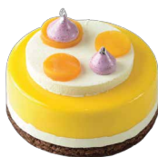
Mango & Lychee Mousse 香芒荔枝慕絲 1lb磅 $258 · 1pc件 $68